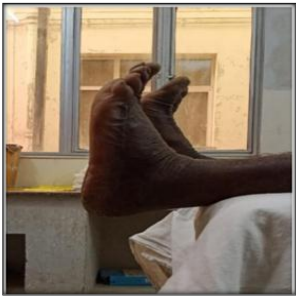
Figure 5: Dorsiflexion at ankle after 4 months of surgery