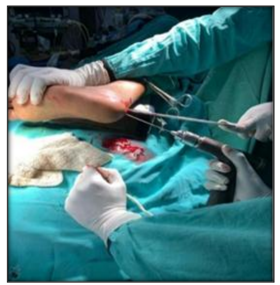
Figure 2: Guide wire insertion from posteroinferior part of calcaneum