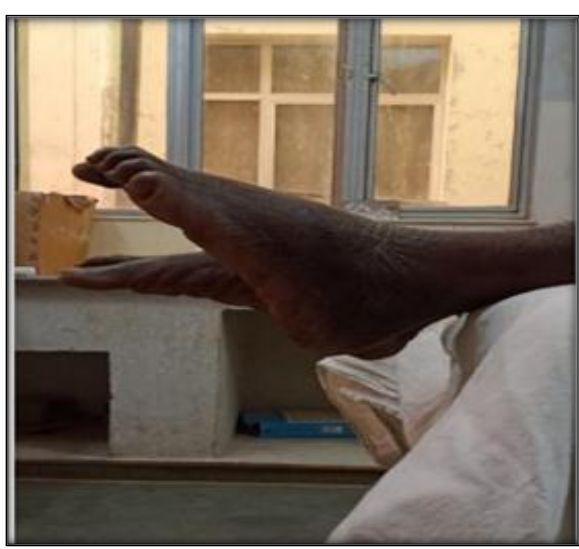
Figure 6: Plantarflexion at ankle after 4 months of surgery