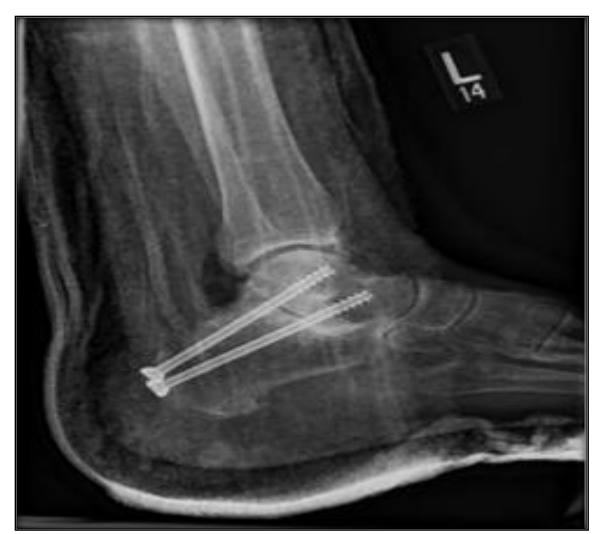
Figure 4: Postoperative xray showing screw fixation (Lateral view)