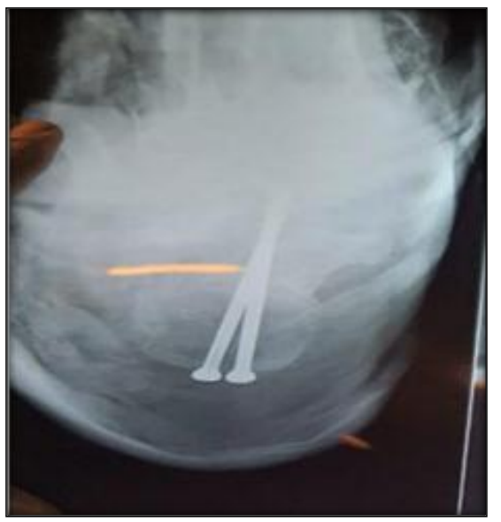
Figure 3: Postoperative x ray showing screw fixation (AP view)