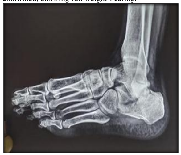
Figure 1: Pre-op Xray showing subtalar arthritis

week intervals until solid arthrodesis union was confirmed, allowing full weight-bearing.